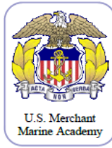
U.S. Merchant Marine Academy