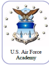
U.S. Air Force Academy