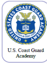
U.S. Coast Guard Academy

High school and middle school students welcome.