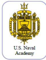
U.S. Naval Academy